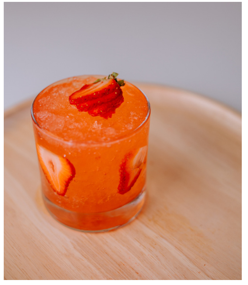
Strawberry Fields Forever

rum | cognac | lemon | orange | orgeat | sherry