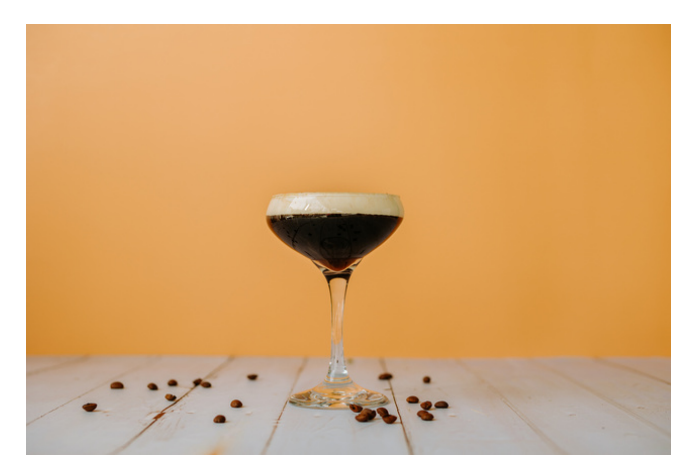
Wake Me Up Before You Cocoa

anejo tequila | crème de cacao | cinnamon syrup | bitters