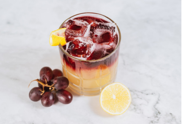
New York Sour