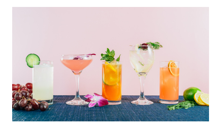
FIZZY & FOAMY 'All egg white cocktails can be made vegar

Garden Gin & Tonic $5.00 gin | aquavit | elderflower tonic