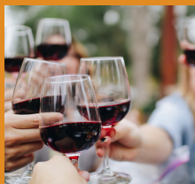
Table-Side Dinner Wine Service

At Peak Beverage, we value having a full-service bar that stands out from the crowd. We have various à la carte offerings that can be added to any of our packages! Reach out to our team for more details on our add-on services.