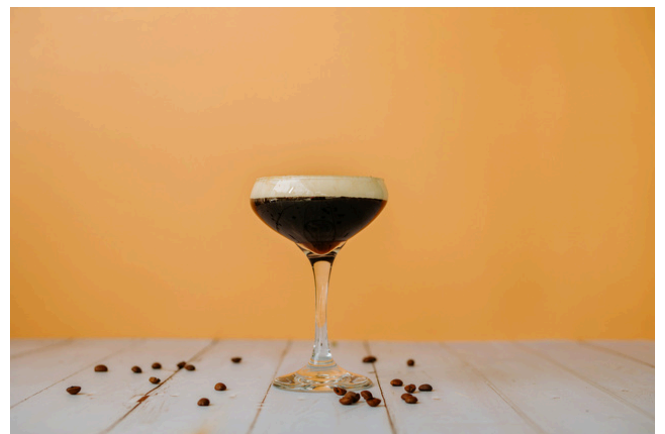
Wake Me Up Before You Cocoa

El Guapo $6.00 anejo tequila | crème de cacao | cinnamon syrup | bitters